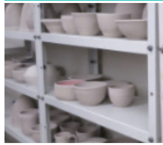
THE ART OF HANDBUILDING IN CLAY WITH KEVIN CONLIN

8 WKS 20 HRS This class is for those interested in the creative clay process of hand building. Open to all levels from beginner to advanced. students will explore methods and rules for working and constructing with clay. Building techniques such as coiling, slab, and pinch will be explored, along with an introduction to working with hump and slump molds. Clay preparation, slips, glazes, and a brief introduction to electric kiln firing will be presented.