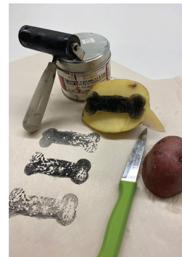
IMAGE MAKING THROUGH LINO CUT